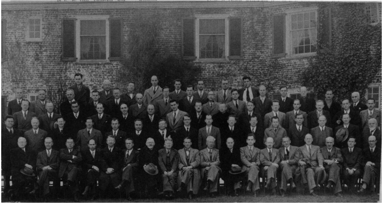
Figure 2. Photograph of participants at the 1947 Society for the Study of Evolution meetings in Princeton. Photograph reproduced from the edited publication of the proceedings (see Jepsen, Simpson, and Mayr 1949). Identification of the all-male participants included therein.